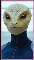
Mikosah Leader of Orion (Olai)

11 For he will command his angels concerning you to guard you in all your ways.