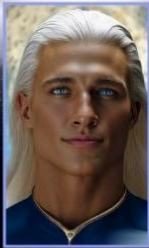
Elder Ikai Leader of Taygeta (Ameka) Commander of Galactic Federation