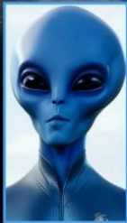
Wanovar Leader of Arcturus (Clashik)