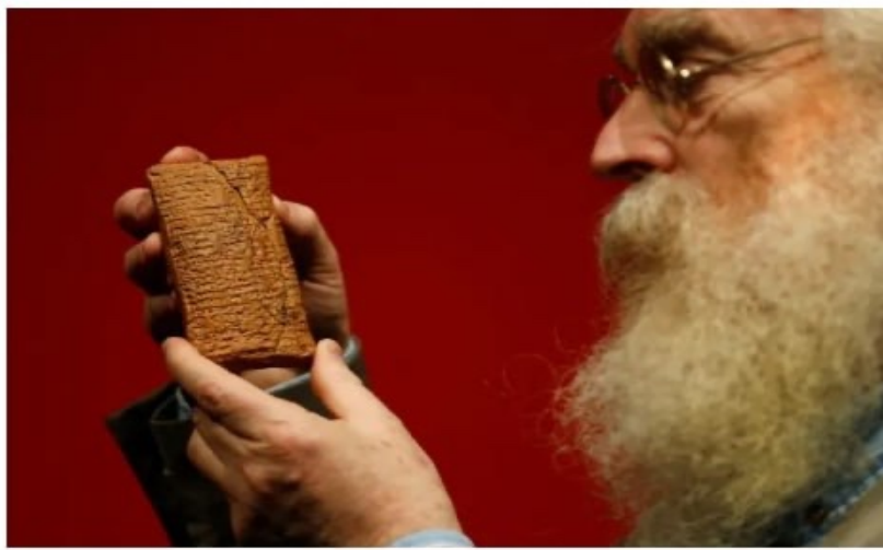
Irving Finkel poses with the 4000-year-old clay tablet containing new information about Noah's Ark.