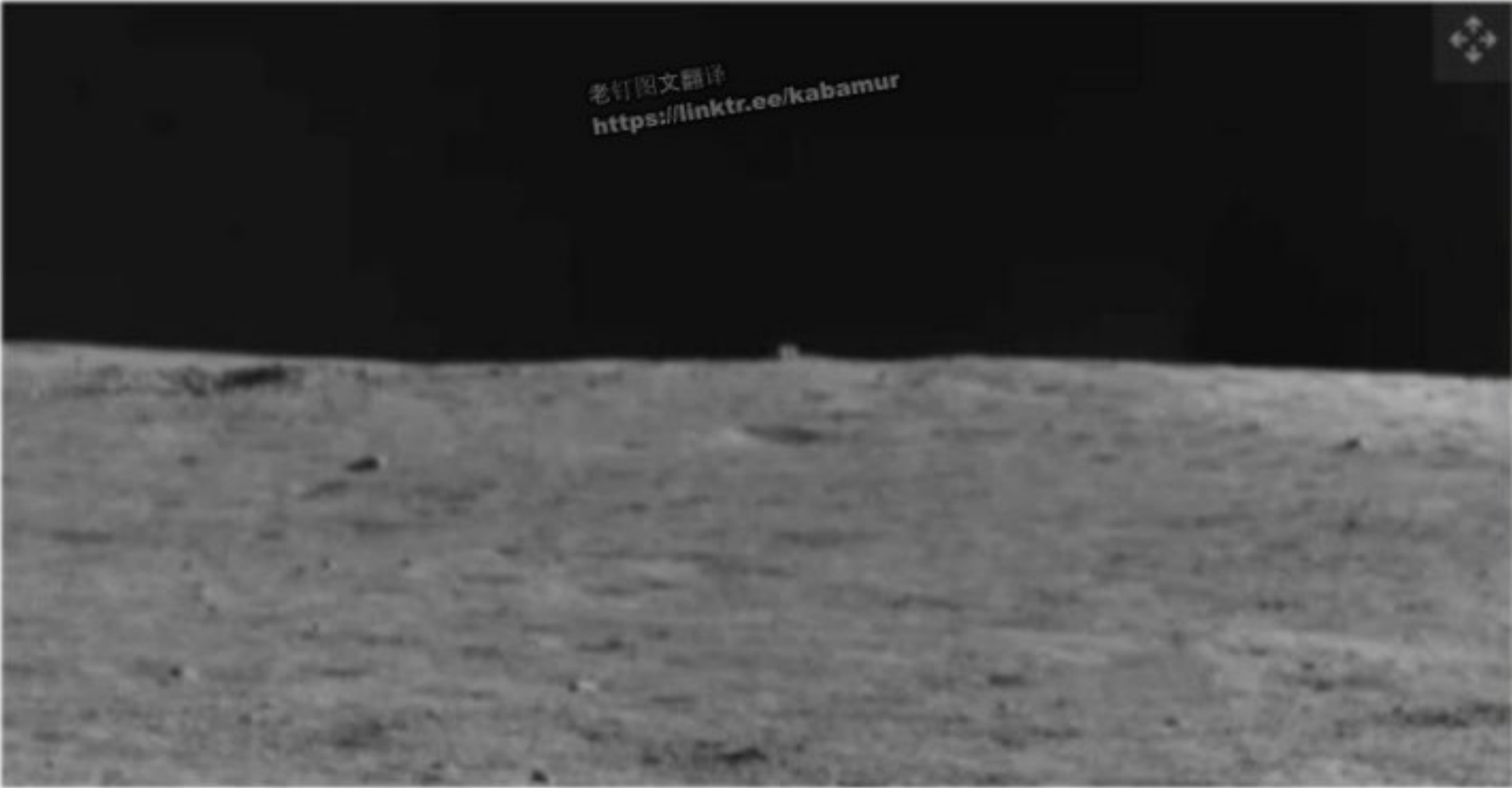
An image from China's Yutu 2 showing a cube-shaped object on the horizon on the far side of the moon.

中国的玉兔2号火星车在月球的远侧发现了立方体形状的“神秘小屋” 大约12小时前被安德鲁·琼斯发现 这很可能是古代月球撞击挖掘出的一块巨石。